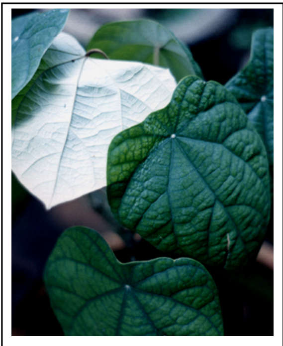
Coscinium fenestratum (Gaertn.) Colebr.

Coscinium fenestratum (Gaertn.) Colebr. [= Menispermum fenestratum Gaertn.] Vernacular names: Hindi - Jhar-i-haldi; Sanskrit - Daru-haridra; Tamil - Mara-manjal. Trade names: Tree turmeric